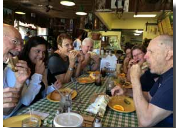
Hanging a show can work up a mighty appetite