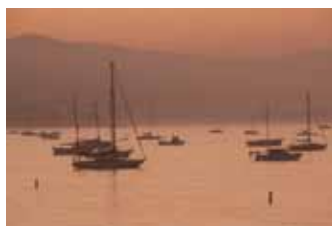
Original Image (Unprocessed)